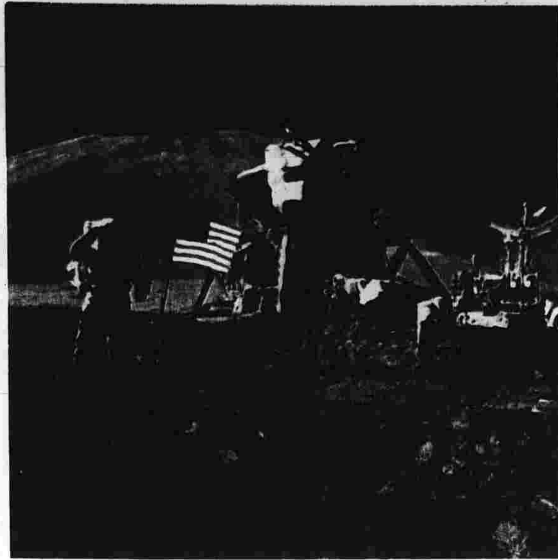
NASA today released these pictures of the Apollo 15 moon mission. On the left, Astronaut James B. Irwin salutes while standing beside the flag on the surface of the moon. At right, the Command and Service Modules in lunar orbit is shown as taken from the Lunar Module. The Service Module's Scientific Instrument Module bay is clearly shown. Other photos on Page 9.