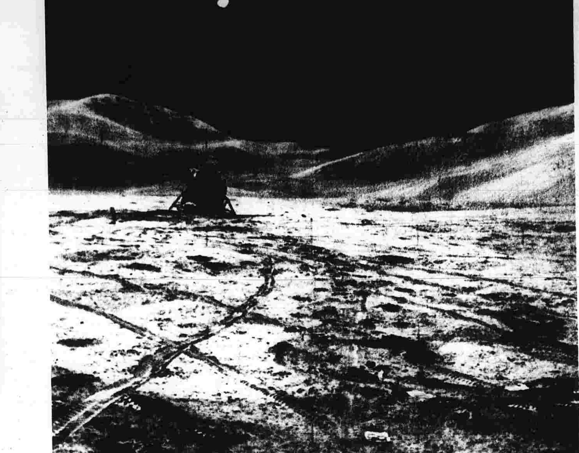
background and Last Center to right of LM. Bootprints and Rover tracks can be seen. Light spherical object is lens reflection.

Astronaut Irwin walks away from Rover parked near edge of Hadley Rille.