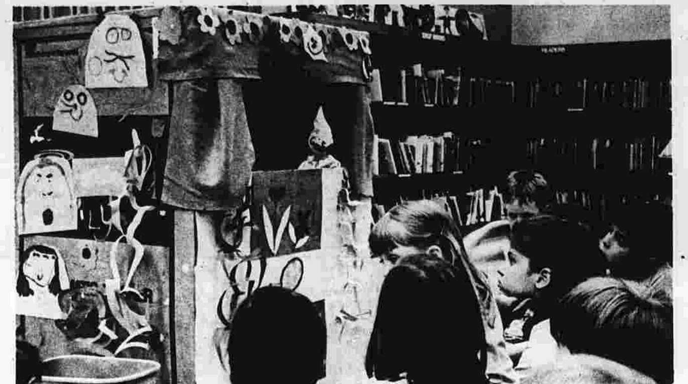
The drama and puppetry classes of the town's summer recreation program ended yesterday with a puppet show in the junior room of the Mary Cheney Library...