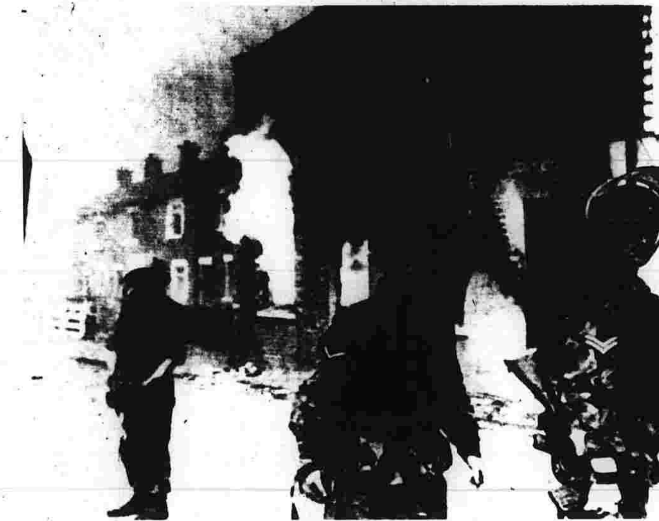
British troops stand guard over burning home in Ardoyne area of Belfast last night.

By HOWARD BENEDECT AP Aerospace Writer SPACE CENTER, Houston (AP)—The space agency today released five strikingly beautiful color pictures taken by astronauts David R. Scott and James B. Irwin as they explored a valley of the moon at Hadley Base. Scientists, meanwhile, continued their preliminary examination of Apollo 15's moon rocks and doctors scheduled an extra physical exam for the astronauts, who returned safely to earth Saturday from their 12-day journey. The first Hadley Base pictures released show the astronauts saluting the American flag; Irwin sitting in the moon buggy and standing beside it, and the buggy by itself, surrounded by the footprints of the explorers. Rising in the distant background in four of the pictures are sections of the Apennine Mountains, their tops rounded like terrestrial hills. A sixth color shot shows the command ship Endeavour orbiting 70 miles above the moon. It was snapped from the Falcon while the two ships were separated. The National Aeronautics and Space Administration also released nine black and white photos of similar content. It delayed release of a film clip until Wednesday. Dr. Charles A. Berry, the astronauts' chief physician, sum-